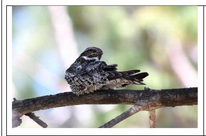
Common Nighthawk / Malcolm Blanchard North Eagle Lake CG / 6-2-23