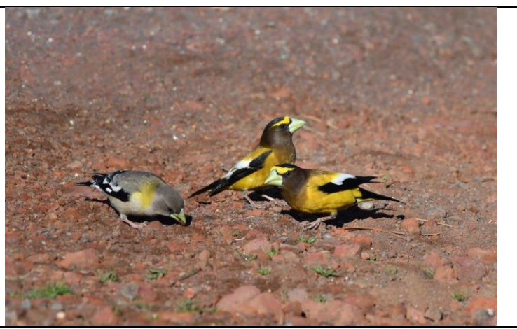
Evening Grosbeak / Rick LeBaudour Near Lasser NP / 6-3-23