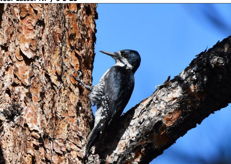
Black-backed Woodpecker / Rick LeBaudour Eagle Lake, west shore / 6-2-23

Eastern Kingbird / Rob O'Donnell Salmon Creek Road / 5/23/23