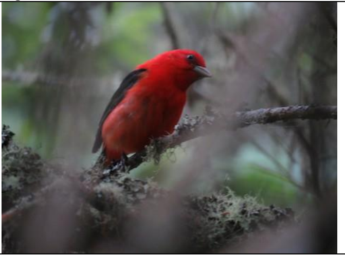
Scarlet Tanager / \Josh Snead Hole-in-the-Head / 6-6-23