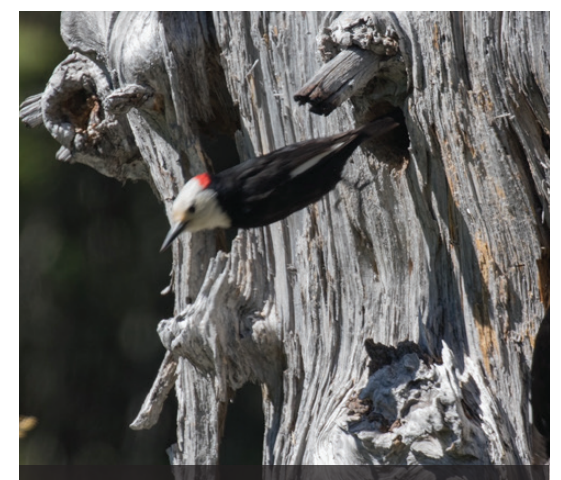
White Headed Woodpecker • Humboldt County June 2021