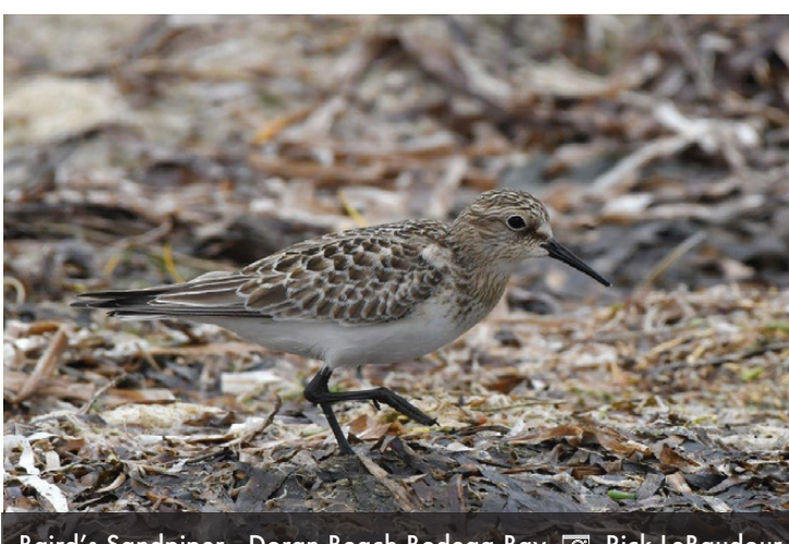
Baird's Sandpiper , Doran Beach Bodega Bay