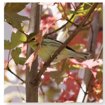
words and photo by Levi Rehberg

"At first it was just another sunny day at our house. I was looking out the window at our bird feeder, which was a small dish in which we poured wild bird seeds, and next to that feeder was a tree that the birds liked to hang out in. At the certain time of year in which I saw the warbler, most of the birds that came to the feeder were house finches, so I didn't expect to see any thing cool till winter, when the sparrows came. So as I was saying there was a tree next to the feeder and that was where I saw it. All I saw at first was a small yellow bird jumping around in