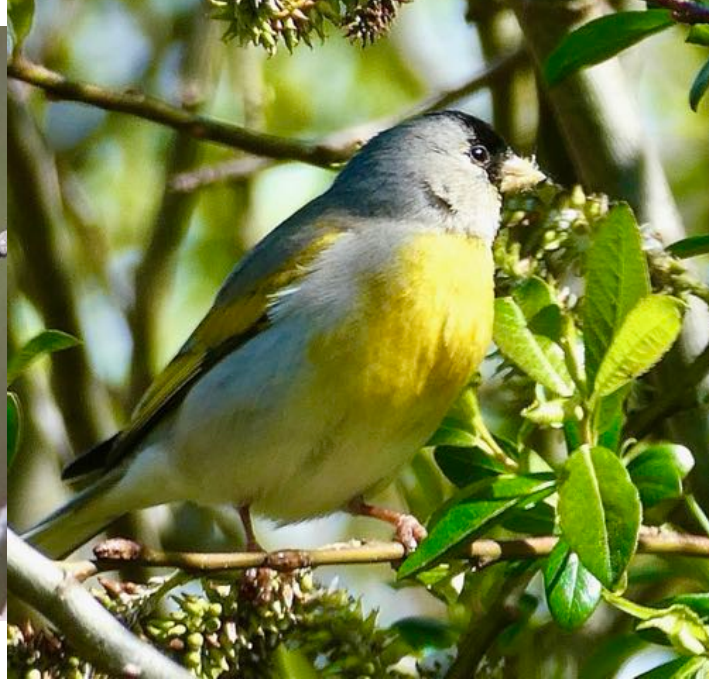
Lawrence's Goldfinch - Santa Rosa Creek Trail