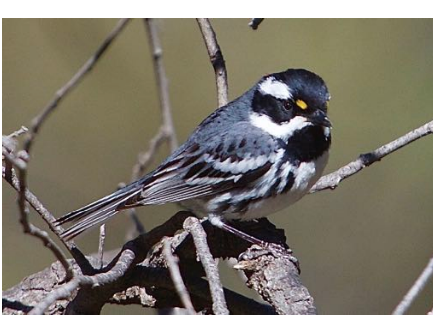
Black-throated Gray Warbler - Spring Lake Regional Park