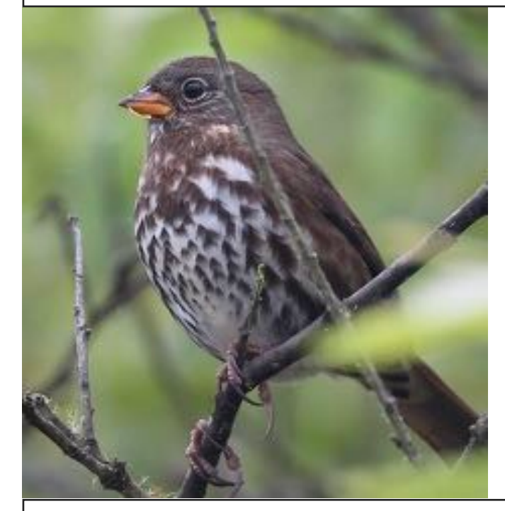
Fox Sparrow - Sonoma Co