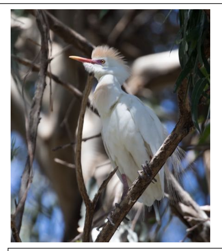
PHOTO GALLERY - end of season salute to some SoCo residents, seasonal visitors, & a '23 rarity: LAGO