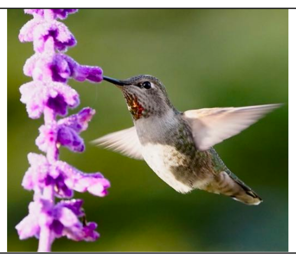
Anna's Hummingbird-Sonoma Co