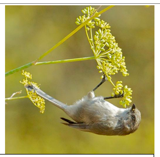
Bushtit-Spring Lake Regional Park