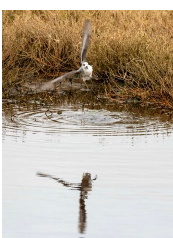
Red-necked Phalarope-Doran entrance ponds