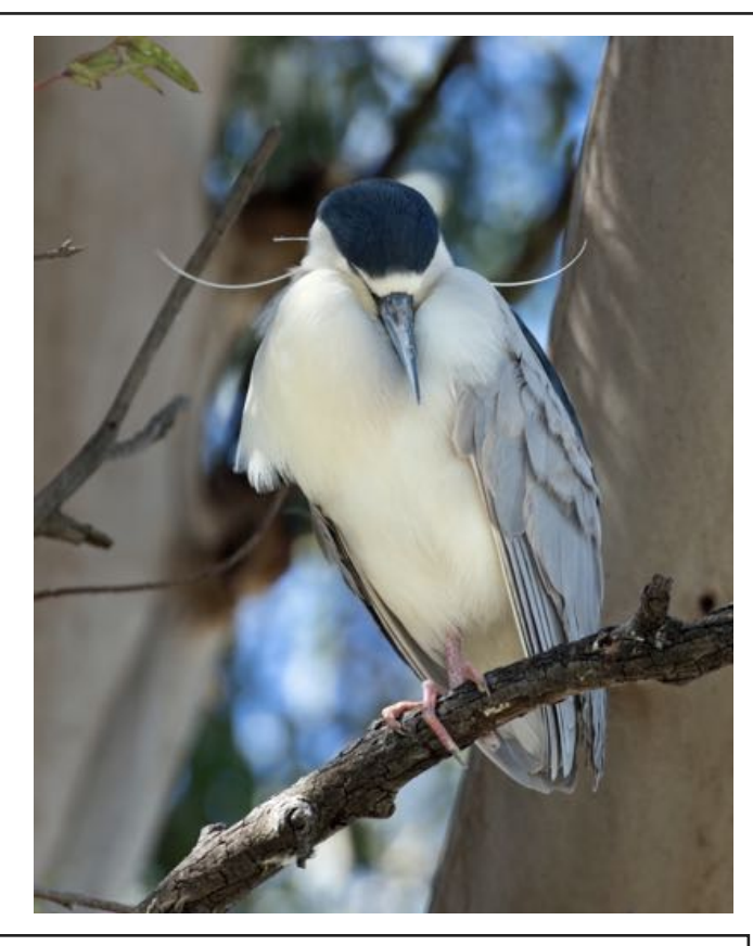
L: Cattle Egret; R: Black-Crowned Night Heron - Ninth St Rookery, Santa Rosa