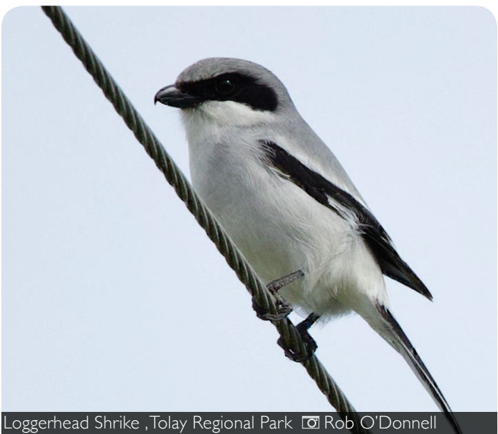
Loggerhead Shrike, Tolay Regional Park