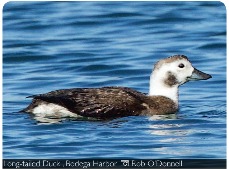
Long-tailed Duck, Bodega Harbor