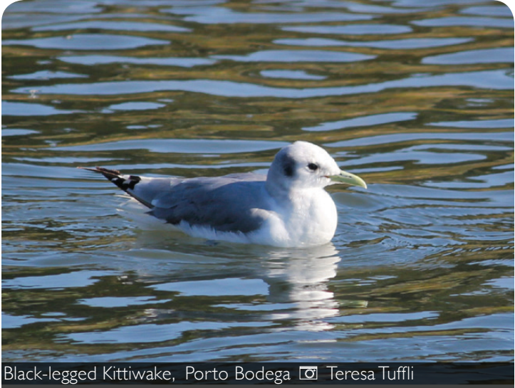
Black-legged Kittiwake, Porto Bodega