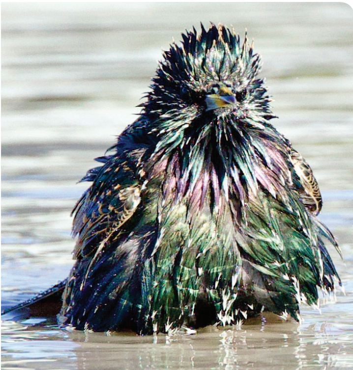
European Starling, Bodega Harbor