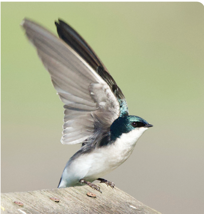
Tree Swallow, Tolay Regional Park