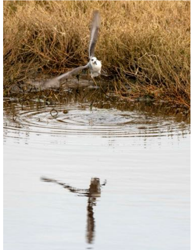
Red-necked Phalarope-Doran entrance ponds