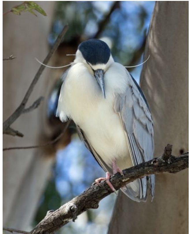
L: Cattle Egret; R: Black-Crowned Night Heron - Ninth St Rookery, Santa Rosa