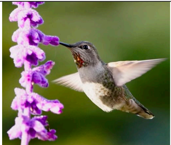
Anna's Hummingbird-Sonoma Co