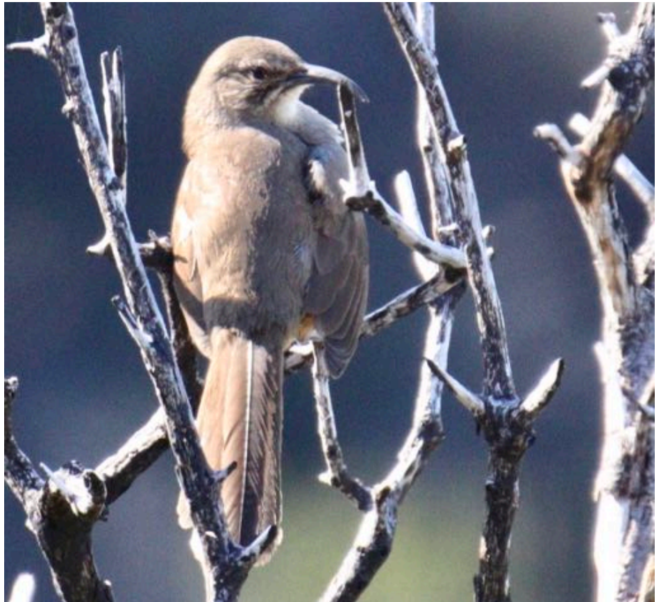
California Thrasher Pine Flat Road