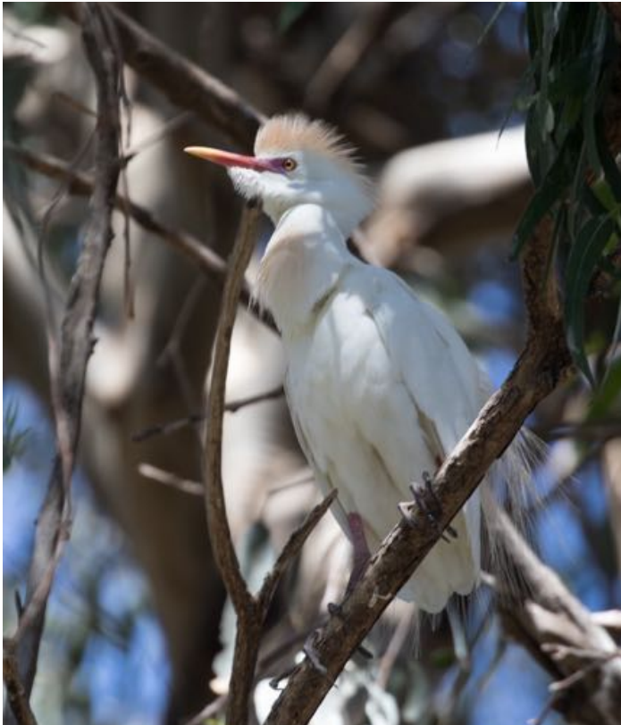
PHOTO GALLERY - end of season salute to some SoCo residents, seasonal visitors, & a '23 rarity: LAGO