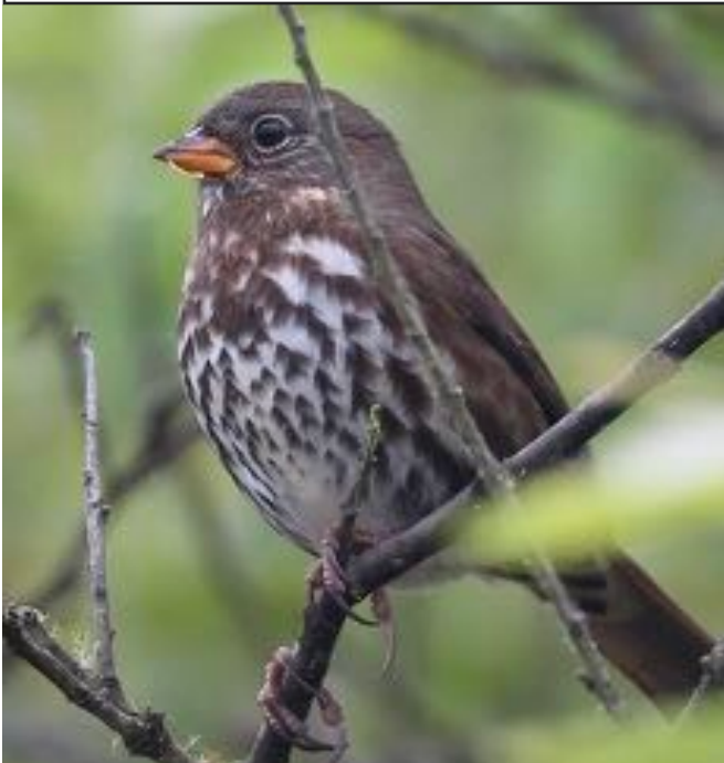
Fox Sparrow - Sonoma Co