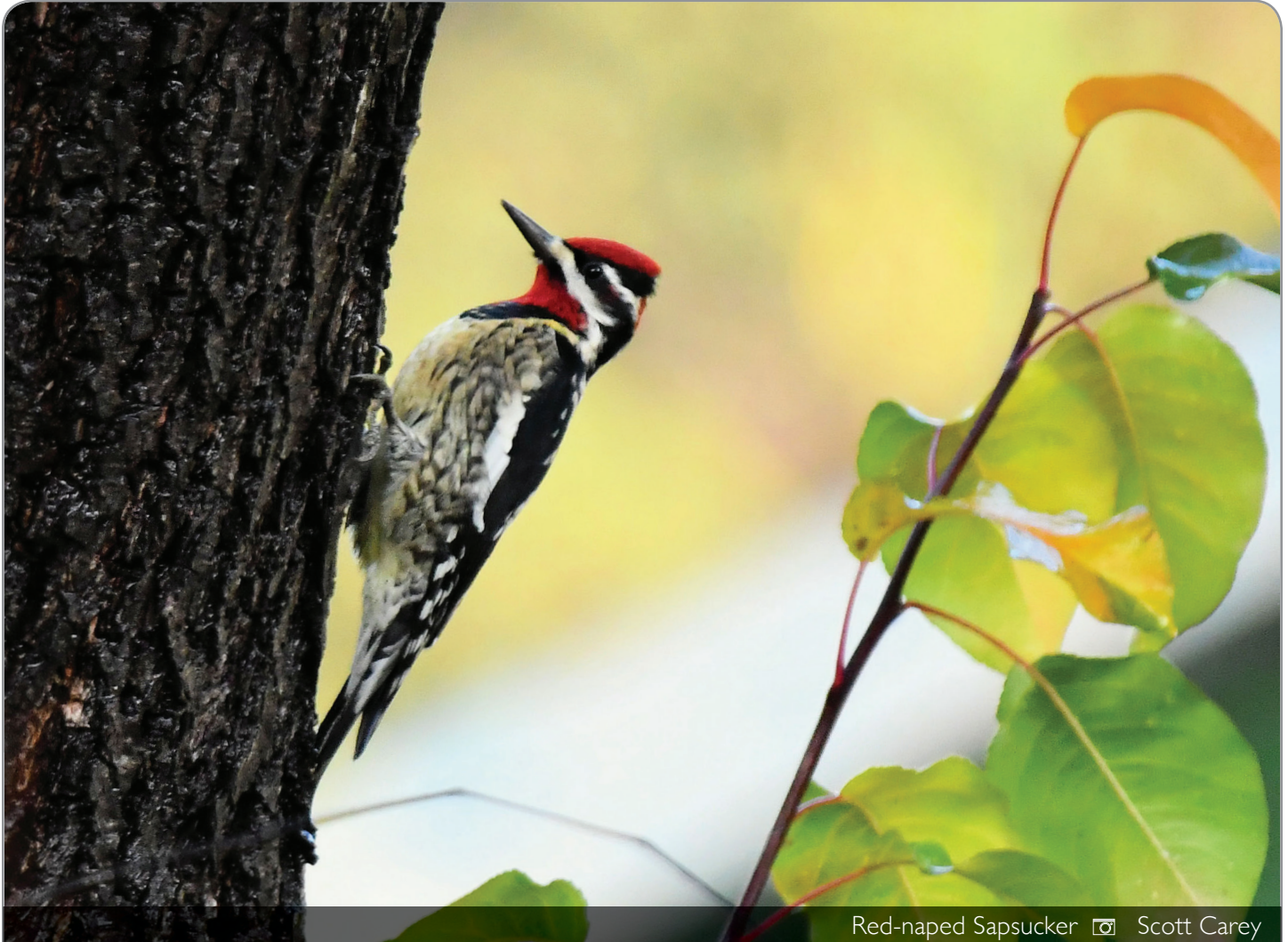
Red-naped Sapsucker