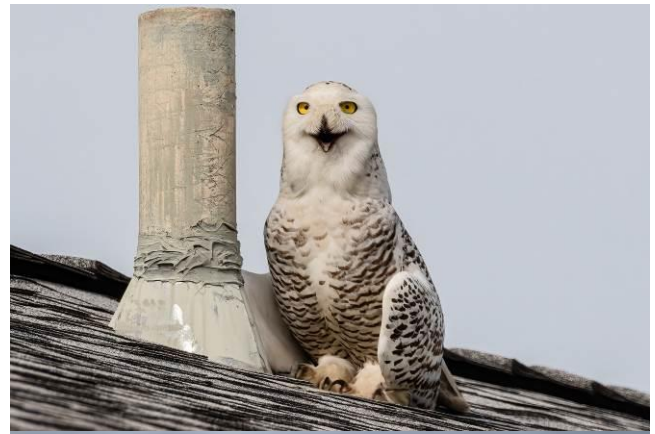
Photo credits: Snowy owl - Sam Sivakumar Steller's Sea Eagle - Alphonus Deodatus