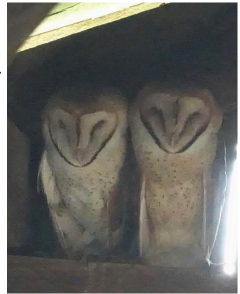
Barn Owls, Tolay Lake Regional Park

In January, we started off the new year by visiting Tolay Lake Regional Park. We met late in the afternoon and the early arrivers had fun watching two Golden Eagles circle in the sky above the hills on the east end of the park. When everyone was together, we peeked inside one of the barns and spied on two Barn Owls , a male and female huddled together. This was a great start! Then, we hiked along the Burrowing Owl Trail, and to our delight, the Burrowing Owl was sitting by its burrow in a rockpile safely off the trail from ogling trail walkers. We returned to the parking lot to gather warm clothes for the evening Short-eared Owl watch. This is where Levi and Bea spotted a first-of-season Allen's Hummingbird for the group in the flowering Eucalyptus trees. We topped off the evening by watching the glorious sunset as the Short-eared Owls miraculously appeared out of the wetlands to cruise over their hunting grounds in their classic harrier-like style.