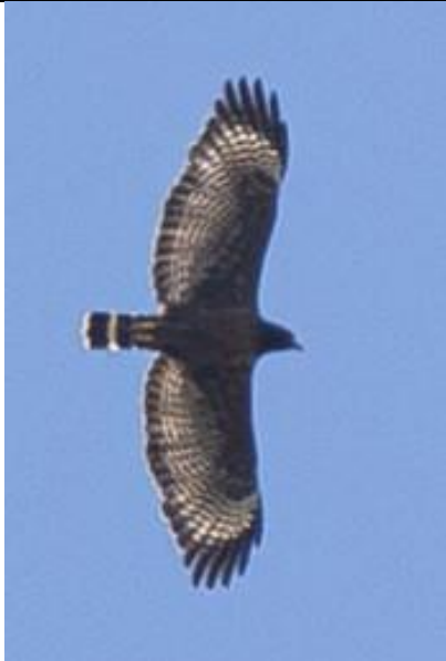
Common Black Hawk x Red-shouldered Hawk, Santa Rosa Creek trail, April 2, 2024