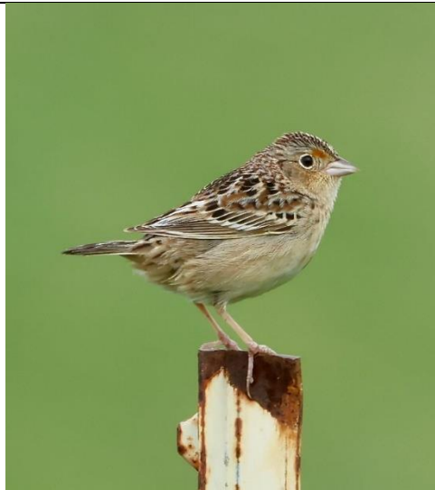
Grasshopper Sparrow, March 18, 2024, Crane Creek Regional Park