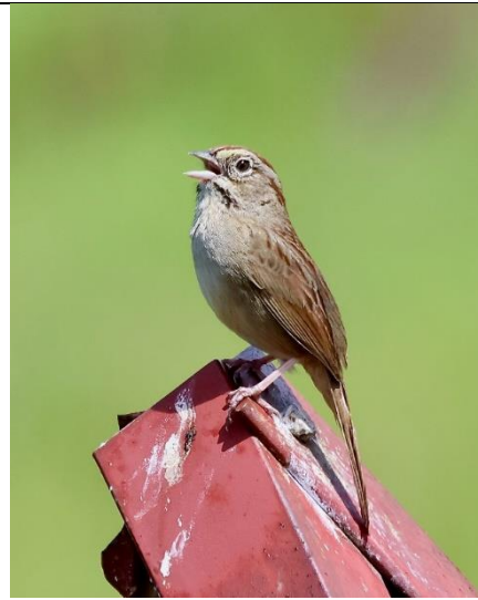
Rufous-crowned Sparrow, April 16, 2024, Pine Flat Road, Scott Morrical photo