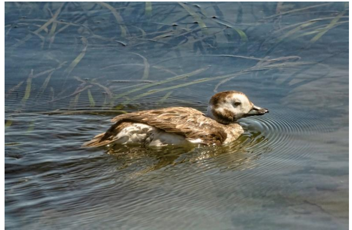
Long-tailed Duck, female, Bodega Harbor, April 1, 2024