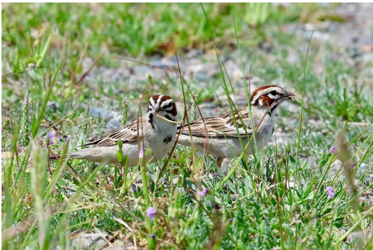
Lark Sparrows, Pine Flat Road, April 16, 2024